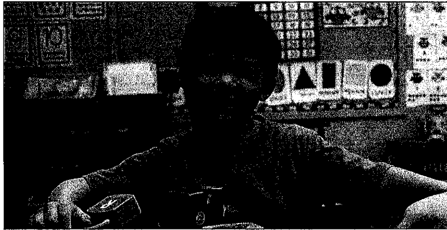
A 2016 Noah's Ark Preschool student was all smiles from benefiting from the Harrison County Community Foundation's Jump Start preschool program.